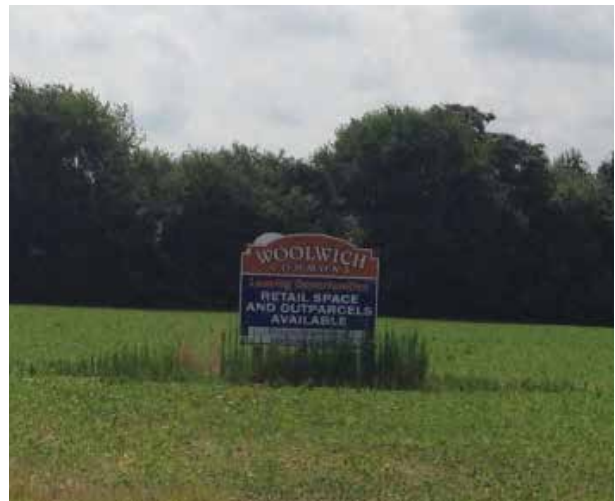
Woolwich Commons, the first phase of major retail development in the Center.