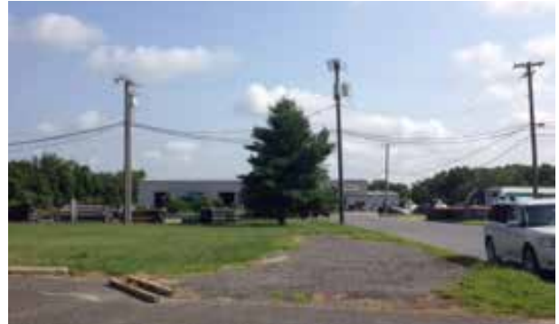
Present industrial park.