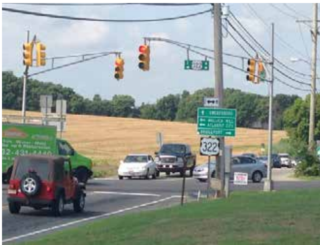
Intersection of Route 322 and Kings Highway.

Another key component of the Township's landscape is the New Jersey Turnpike, which intersects the Township. Turnpike Exit 2, located at the eastern side of the Regional Center, is the last exit to remain largely undeveloped. Other than as an origination and destination for traffic, the Turnpike and its exit have had little development impact to adjacent land in the Township. Route 322 is another story. This federal highway bisects the Township and is the only east-west corridor with easy access to heavily traveled highways such as I-295 in New Jersey, Route 55 and the New Jersey Turnpike, as well as the Commodore Barry Bridge, I-95, and the Blue Route (Route 476) connecting South Jersey to Philadelphia and its suburbs. The two-lane Route 322 carries heavy truck traffic year-round. Particularly in the summer, traffic to and from the Jersey Shore is, in the words of many residents, "a nightmare." Route 322 and Kings Highway intersect in the heart of the planned Regional Center.