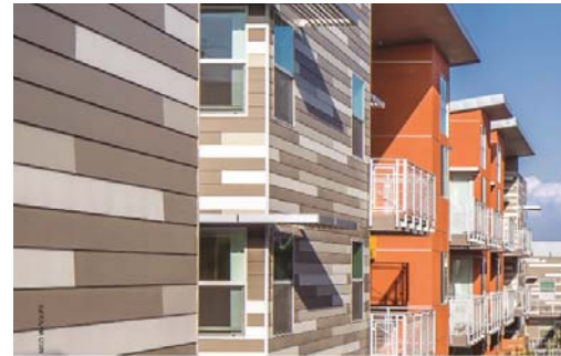
Emerging Trends in Real Estate®

Thank you to our returning title sponsors Key Bank and First American Title Insurance Co. , plus supporting sponsors Ballard Spahr , M&T Bank and RSM . Space is filling up so register online quickly at philadelphia.uli.org . ULI members receive a discount on registration.