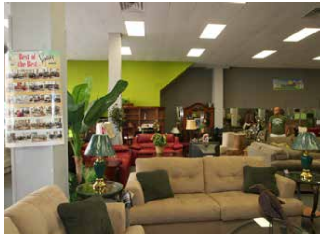
Interior of store.

stated that the owner rejected an offer for $640,000 in 2012 as he believes it is worth closer to $1 million . It is believed that the property has a retail tenant with three years remaining on a five-year lease at $72,000 a year, possibly with a five-year extension. The retailer has multiple locations within the Philadelphia market and independent observations indicate that this location is probably the weakest of the group.