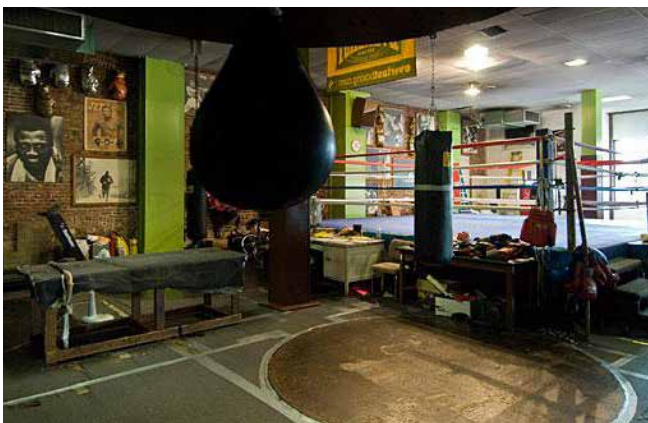
The gym where Joe Frazier trained for his victorious bout against Muhammad Ali.

Time and again, local community members spoke of a twofold use of the building: honoring Joe Frazier and creating a community center that would provide much-needed activities for the neighborhood's children.